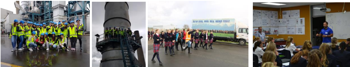
Waikato Diocesan School for Girls experiencing science and technology through Contact Energy, CRV Ambreed and Boffa Miskell

"I liked meeting people who use what we learn in class on a daily basis in their careers because it helped me find a purpose for what we are learning." (Waikato Diocesan School for Girls student)