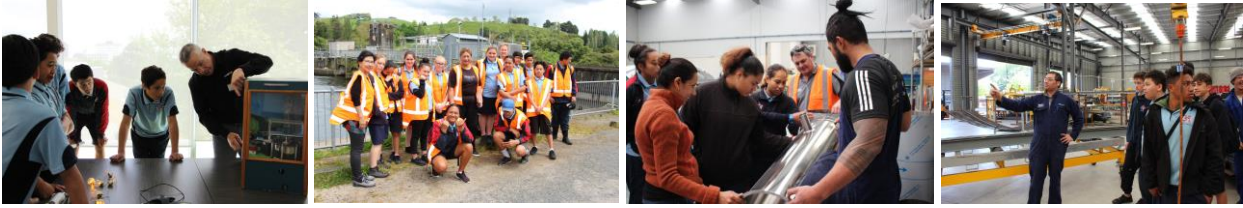
Huntly College students and teachers experiencing 'real world' maths and science at Mercury and Waikato Milking Systems

"It was fascinating to learn about the different careers and it also helped me broaden my scale of job choices. It inspired me to think more about what I would like to do." (Huntly College student)