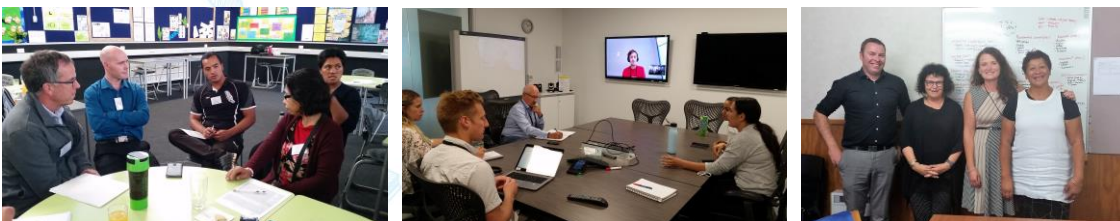
Teachers and employers collaborate to create contextual learning opportunities for students