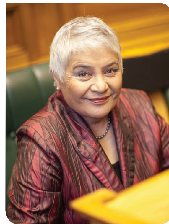
Hon. Dame Tariana Turia, (Ngāti Apa, ↑ Ngā Rauru, Whanganui iwi) Political leader, Smokefree champion

← Whina Cooper, 1895–1994 (Ngāti Kuri) Led the 1975 land march from Te Hāpua to Parliament